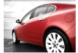
Automotive & Power