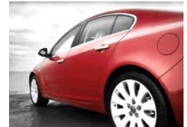
Automotive & Power